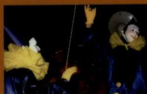
Limoux, a festive wine