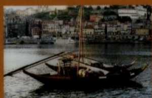
Porto, the gentleman of the Douro