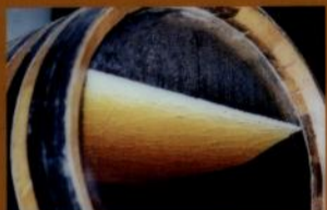
Under the veil of Sherry