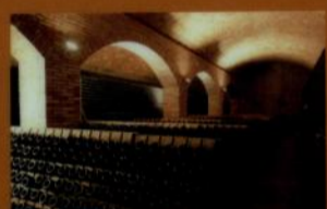
Cava, sets out to conquer the world

Quarterly N°3 November 2001 By yearly subscription only Price per edition: 8,5 € - 55,76 FF