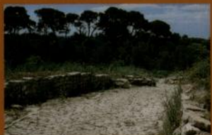
Late harvests along the Via Domitia