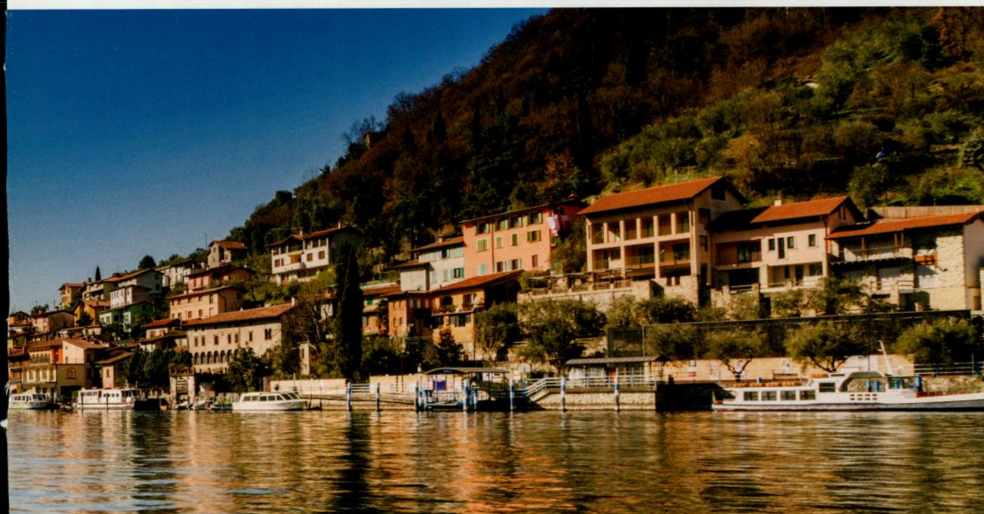
All photography courtesy of Consorzio Franciacorta