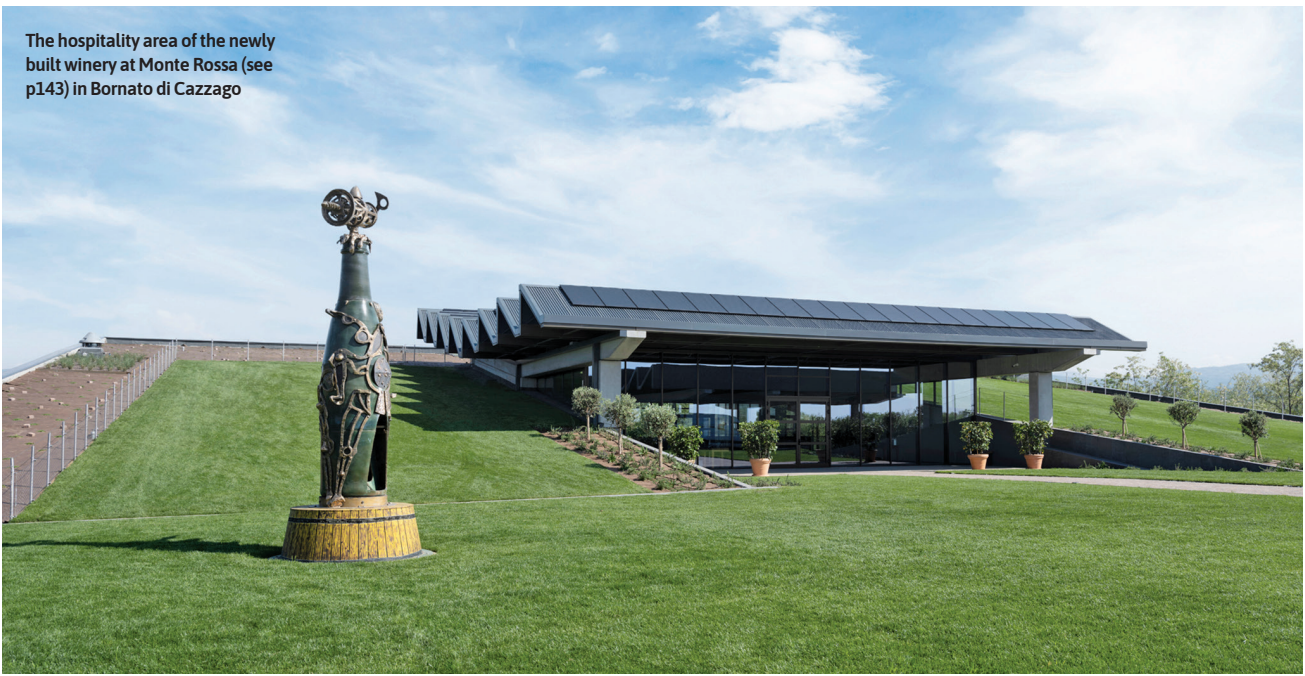
The hospitality area of the newly built winery at Monte Rossa (see p143) in Bornato di Cazzago

Vigneti Cenci, La Capinera Brut AH 90 JM 90 FM 91 £30 Graft Wine Co A creamy, orchard fruit nose accented by hints of peach and ripe stone fruit. The palate is smooth and soft, with fine bubbles, vibrant acidity and delightful minerality. A refreshing and energetic example. Drink 2024-2028 Alc 12.5%